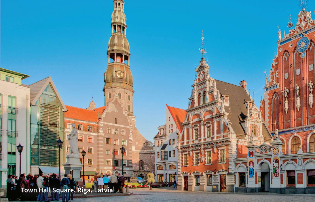
Town Hall Square, Riga, Latvia