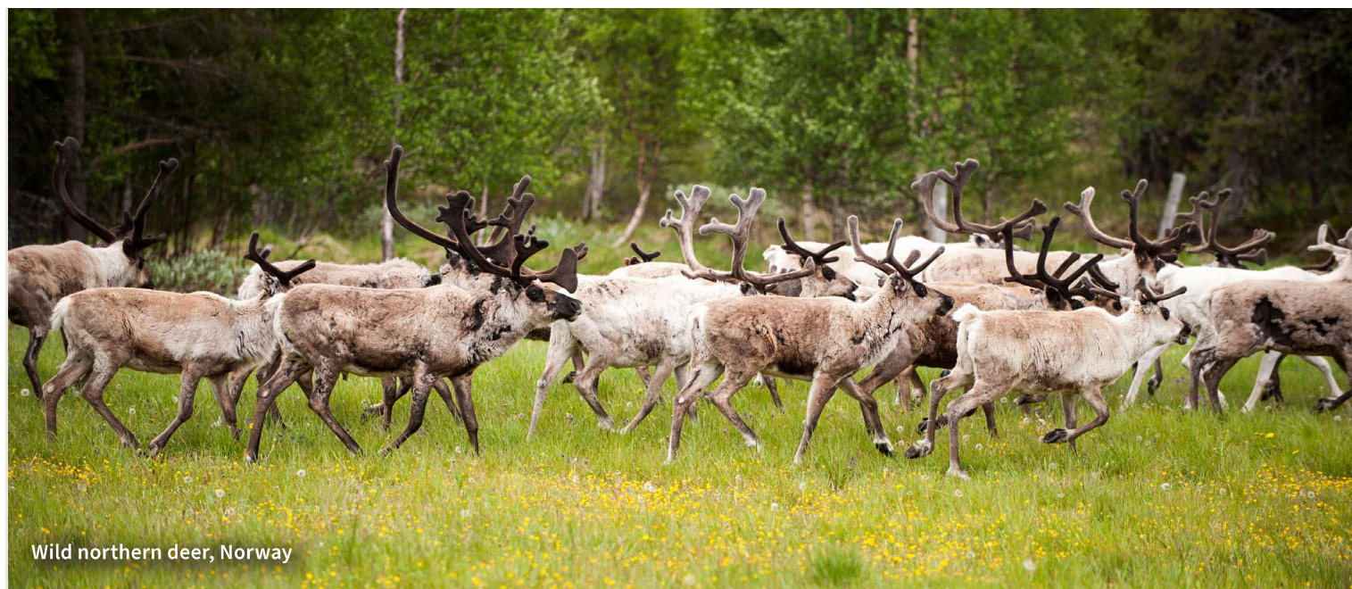
Wild northern deer, Norway