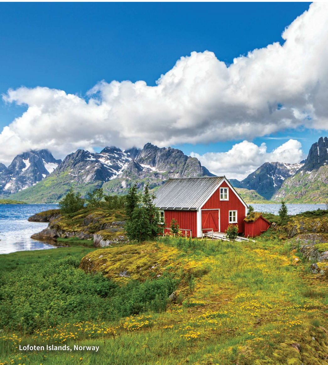
Lofoten Islands, Norway